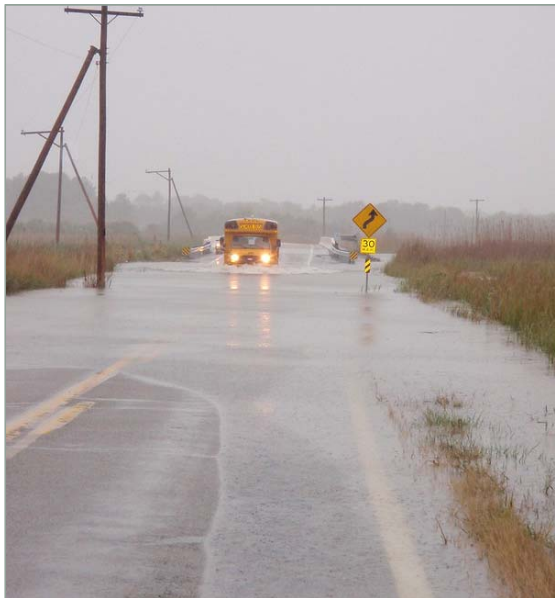
Sea Level Rise